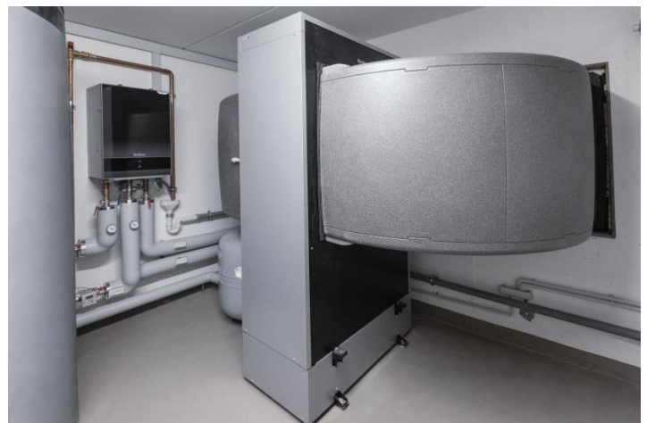
Reference: Bosch Thermotechnik GmbH

In each of the ten flats a fresh water station is installed. The supply line, which feeds the fresh water stations, is connected at the very top of the storage. Therefore, the upper part of the storage is heated up to 55°C. The supply line for the heating circuit (floor heating) is connected about one third below the top of the storage. The design temperature of the floor heating is 38°C/30°C. Heating circuit and fresh water stations are using one common return line. Via a valve, the returning water is either feed to the very bottom of the storage or right above the partition plate.