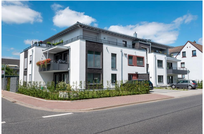
Reference: Bosch Thermotechnik GmbH

The new building in Bruchköbel, Germany, contains 10 apartments on a heated living area of 1.000m 2 . The builder-owner is leading his own construction company and he and his team developed the whole design for the technical system. They also supervised the construction personally.