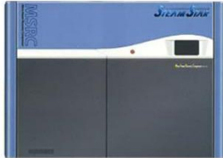
Figure 1: External appearance