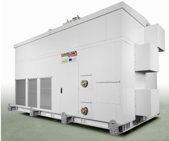
Figure 2: Plug & play heat pump

The oil lubrication and recovery system are integrated within the heat pump package and the entire skid is installed into a ventilated enclosure by customer request.