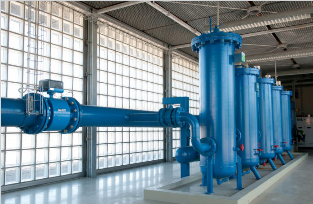
Fig 1: Geothermal district heating in Thisted [www.thisted-varmeforsyning.dk].